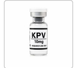
KPV 10mg - FRP-578100626