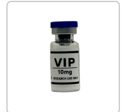
VIP 10mg - FRP-847100626